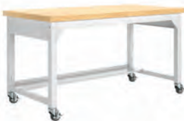
Pictured w/Optional Shelf & Casters

Perfect for Makerspaces and Fab-Labs. It can be adjusted in height from 25 1/2"H to 35 1/2"H. Add the optional 5" locking casters and you'll add another 6" in height. The legs are 12-gauge steel and have 14-gauge stringers for strength and stability. The steel base is finished with a gray baked enamel finish. The static weight capacity is 1400 lbs. without casters and 1000 lbs. with casters added. Need storage? Add the 18-gauge 8"D shelf. Choose from a 1 3/4" thick maple work surface or the 1 1/2" thick ShopTop.