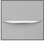
W – Waterfall