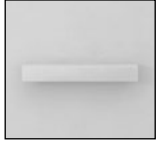
C – Cubic