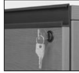
L – Linear