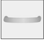
A – Arcade