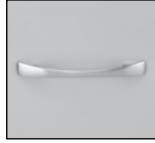
K – Classic