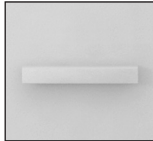
C – Cubic