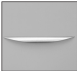
W – Waterfall