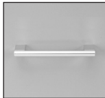
Z – Straight