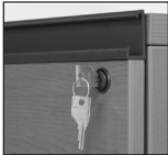
L – Linear