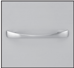
K – Classic