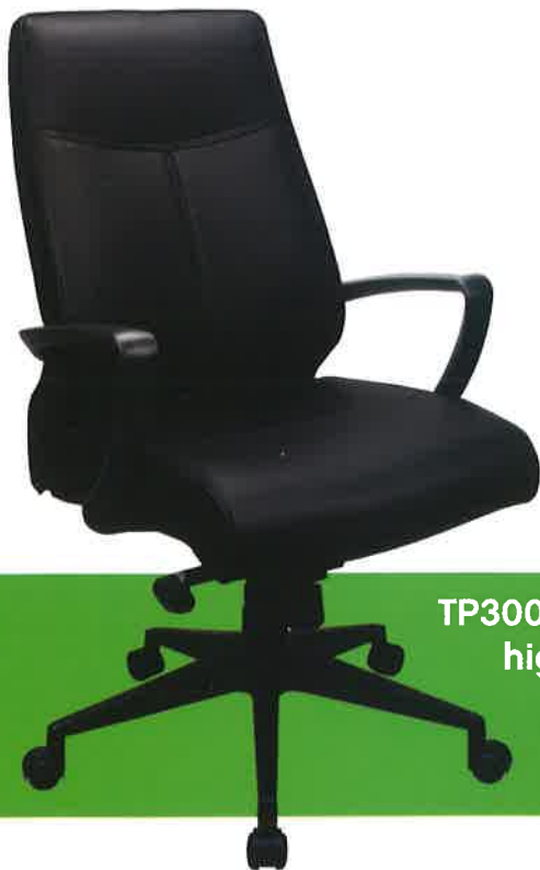
TP300 leather high-back $886

features authentic TEMPUR® material knee-tilt mechanism soft-touch leather waterfall seat