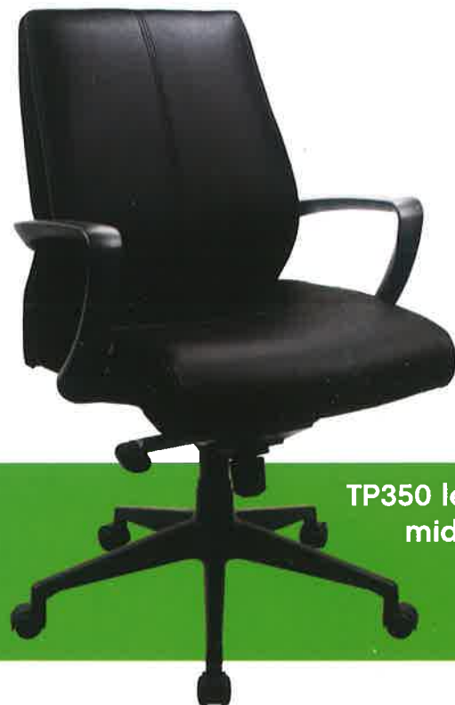
TP350 leather mid-back $860