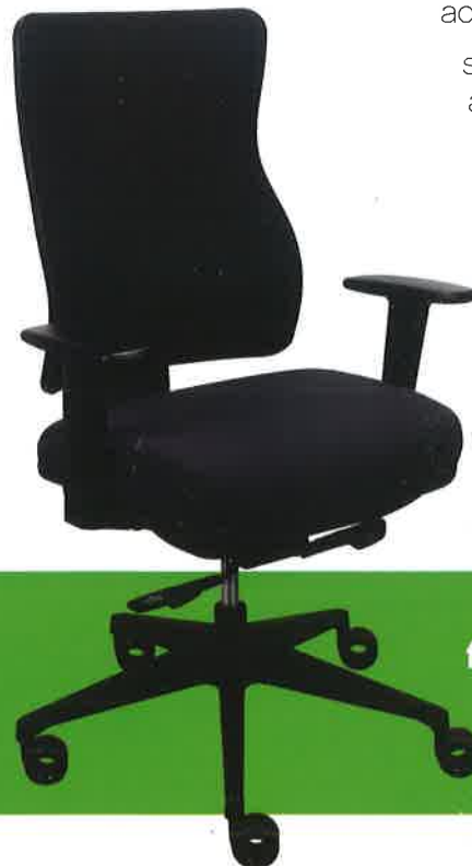
TP250 fabric-back $990