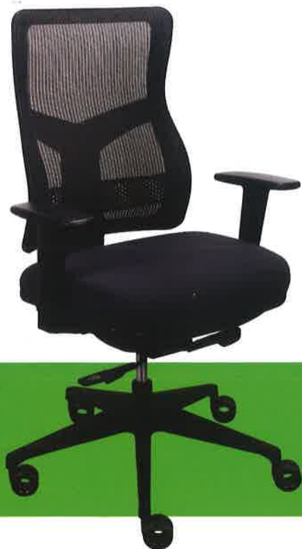
TP200 mesh-back $990